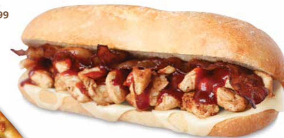
THE SMOKEY JOE™

*Pizza calorie count based on calories/slice. One calzone has the calorie count of a whole small pizza (8 slices).