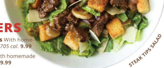
STEAK TIPS SALAD