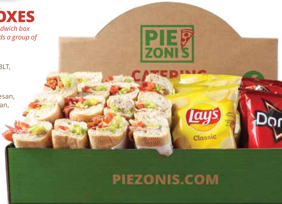
Cold Sandwich Box

ALL OF OUR DELI-STYLE MEATS ARE ALL NATURAL CONTAINING NO CHEMICALS, PRESERVATIVES, OR FILLERS.